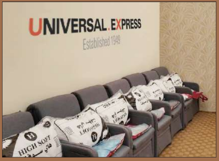
UPGRADE TO PREMIUM VIP SAR 5,000