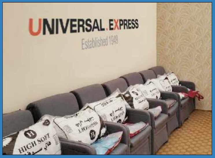
UPGRADE TO PREMIUM VIP SAR 5,000